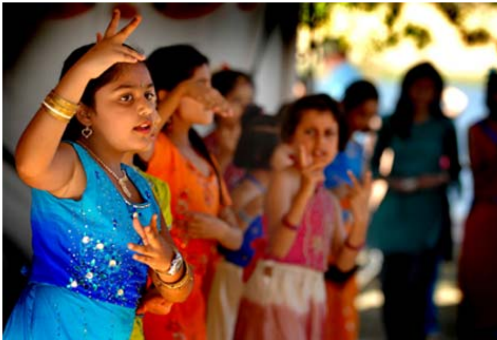
At the Moon Festival. See page 2